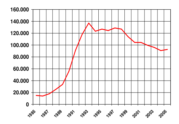
Graph 1: The Rate of Unemployment in Slovenia in the Period 1985 – 2005 (Data from the Office for Statistics RS)

Labour regulation brought, at that time, some relief from heavy financial burden to employers and to the state: employers did not need to pay compensation for the dismissal to workers whose labour contracts expired by law, and the state had no obligation to lend social assistance to these persons. According to the statistics of the Ministry of the Interior, the erased were mostly unskilled industrial workers and in a large part unemployed: therefore, cancellation of their social rights considerably alleviated financial burden of the state in the time of rapid deindustrialization.<sup>25</sup> Moreover, we may estimate, according to the Employment Agency data showing the difference between the employment permits issued in 1992 and 1993, that some 5.000 persons lost their jobs because of these provisions.